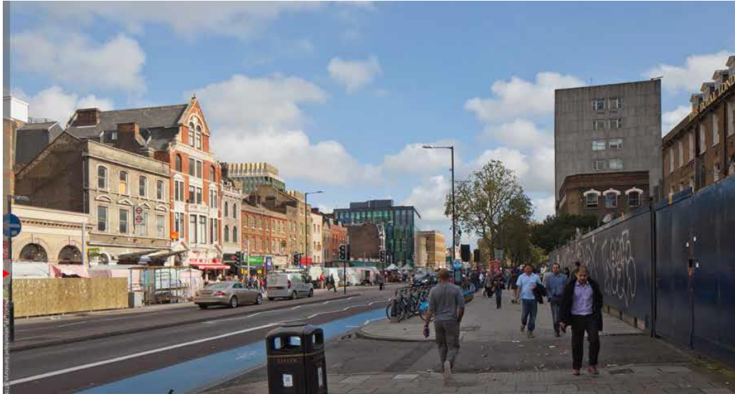
Illustration 2: Looking east along Whitechapel Road with proposed development 121 .