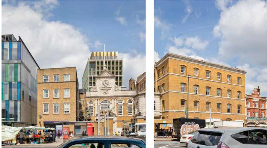
Illustration 3: Photomontage of the Brewery Entrance with Block 3 behind 122